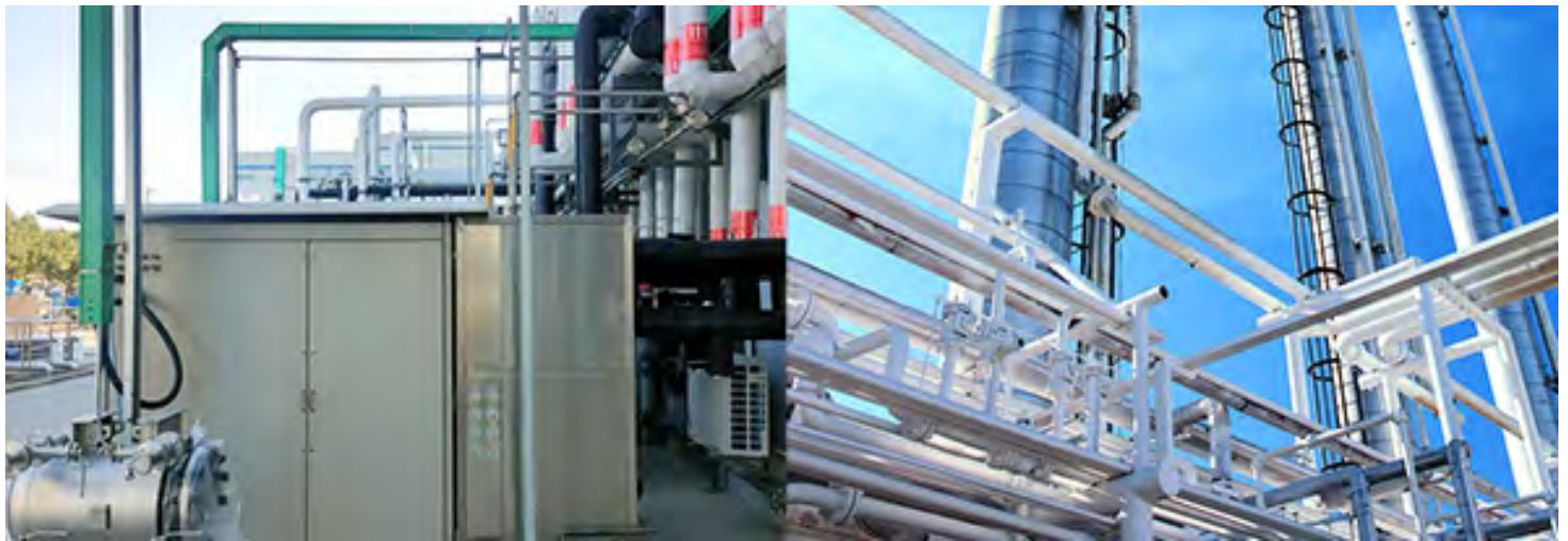
Plate Heat Exchanger Heat exchanger to improve the heat exchange efficiency per unit area